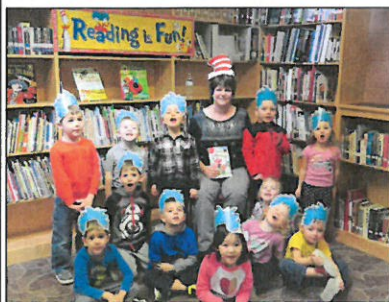
Pic From Read Across America 2018